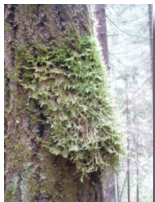
Neckera moss can be seen along the path.

A hilly path rich in history. The path goes from the village of Tuna to the herding stations east of the Mjällån river. Parts of the original herding path have been replaced with a modern forest road, so the walk starts at the beginning of the footpath. There are various walks to choose from along this route, depending on how far you want to walk. One of the most popular walks is between the two bridges Petter Norbergsbron and Jällviksbron. Attractions along the path include a cold spring, trapping pits and a geocache. This path can be combined with the log driving path to make a circular route.