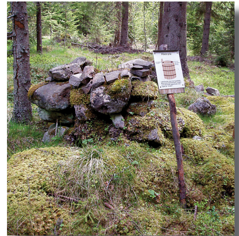
Remains at Björkom herding stations

8. After you get back to your car, we recommend a refreshing swim in the lake. Röjesjön is the perfect place for an evening dip. The evening sun faces the bathing area. The water in the lake is very clean and often heats up quickly to bathing temperature. The lake has a sandy beach and a beautiful sandy lake bed. The lake is also a good place for angling.