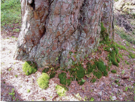
Root of a giant pine

Röjeslingen is a path that connects parts of Kronvägen with Björkom herding stations. Along the path you can admire a beautiful view from Lidbacksberget. After this, you will reach one of the famous Giant Pines. From here you can make a detour to Gluptjärnen, a beautiful small lake. Then the path continues towards the Björkom herding stations, a wonderfully peaceful spot. There are several geocaches along the trail. We recommend waterproof boots most times of the year due to bogs and muddy areas.